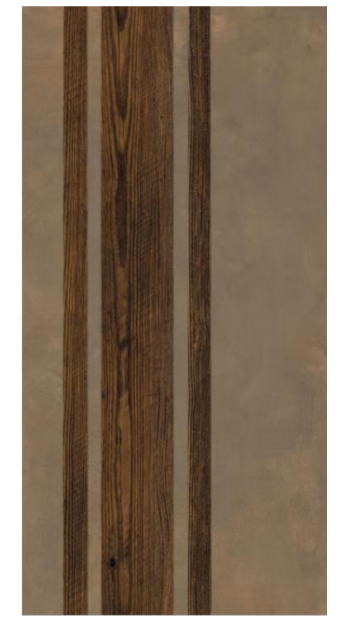
Fusion of Cast Concrete Brown & Cherry Wood Natural