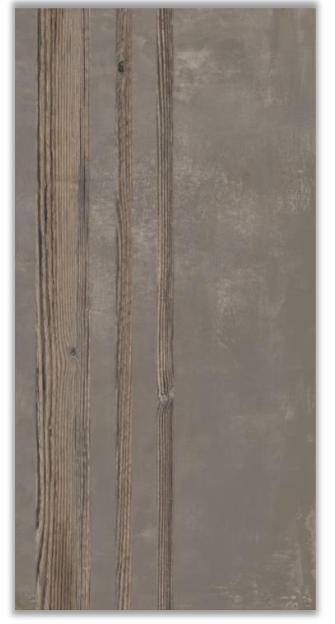
Fusion of Cast Concrete Taupe & Cherry Wood Vintage