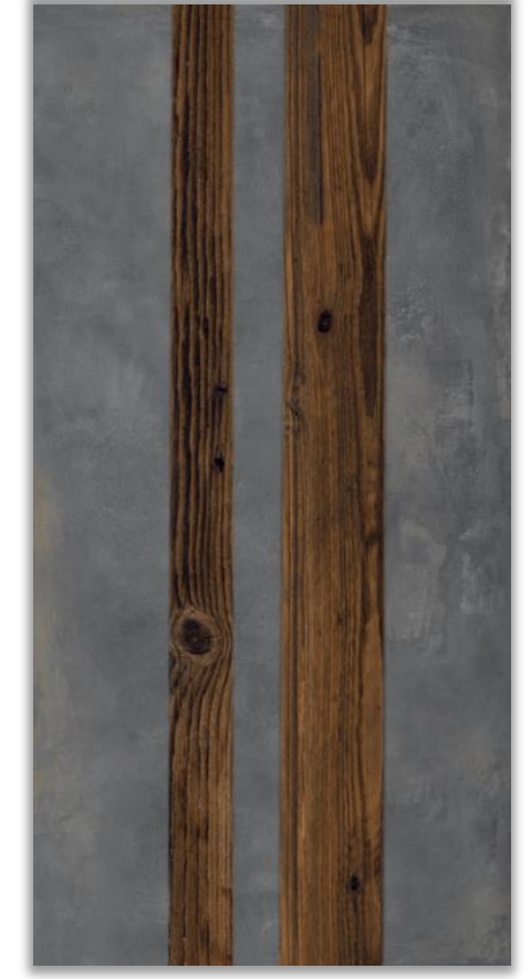
Fusion of Cast Concrete Grigio & Cherry Wood Natural