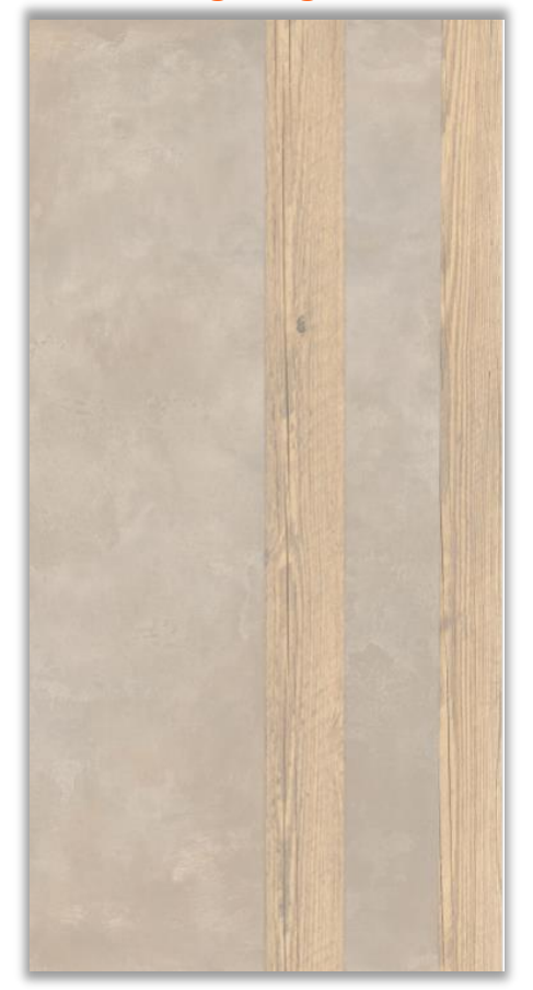
Fusion of Cast Concrete Beige & Cherry Wood Light