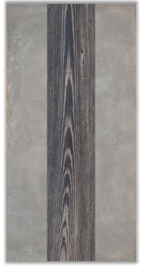
Fusion of Cast Concrete Ash & Cherry Wood Weathered