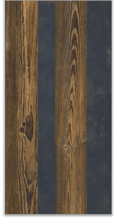
Fusion of Cast Concrete Nero & Cherry Wood Classic